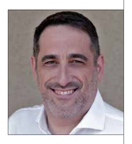
Approved for 1 NACA CE