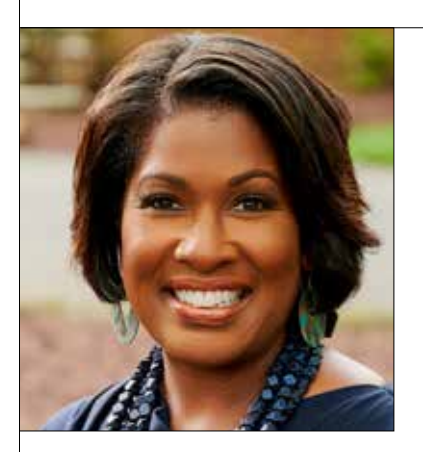
Approved for 1 CFRE CE