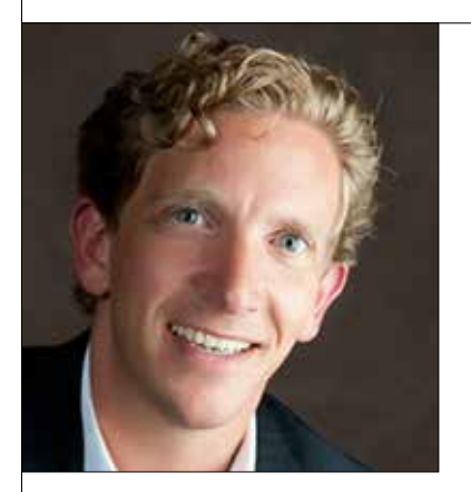
Approved for 1 CFRE CE