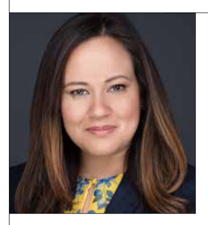
Approved for 1 CFRE CE and 1 NACA CE